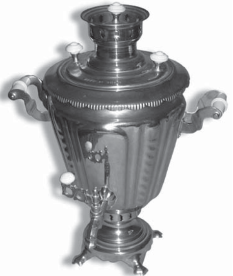
Russian samovar

A traditional type of Russian tea, known as Russian Caravan, will be one of the teas served by Crepes Tea House on January 23. Russian Caravan was originally imported from China via camel caravan. The trip was very long and the trade route was dangerous. As a result, the tea supplies were unsteady. Russian tea merchants blended the incoming tea cargoes; the tea was usually a combination of China and India black teas with a distinctive smoky flavor acquired from the caravan's campfires. You won't want to miss taking part in this unique tea experience. Tea and pastries to be provided by Crepes Tea House of West Springfield. Reservations necessary as seating is limited. Tickets are $25 per person. Please call (413) 322-5660 to reserve your seat!