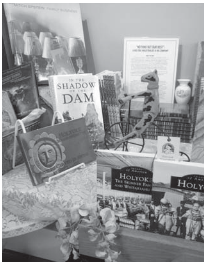
Wistariahurst Museum Gift Shop Hours Saturday, Sunday, Monday 12 p.m. – 4p.m.

Ring in the new year with a visit to the Gift Shop at Wistariahurst. Now, visitors can do more than just experience Holyoke's past with a tour of the site, but can take home a piece of history as well. The Gift Shop offers keepsakes and mementoes and features a wide selection of books and DVDs with themes ranging from historical documentaries to Victorian fashion, cookbooks and more!