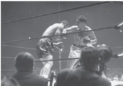
"Marciano fought his first bout at the Valley Arena in Holyoke"